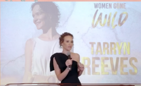
WGW WEALTH EDITION BOOK TOUR