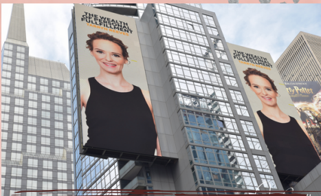
NY TIMES SQUARE BILLBOARD